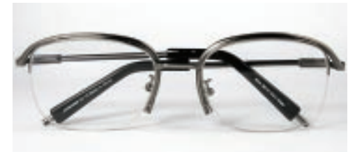
Rectangular, Half-Rim, 53/19 Lens