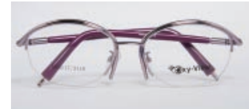
Oval, Half-rim, 51/17 Lens

Oxy-View eyeglass frames are available in several fashionable colors. Please call toll free 1-877-699-8439 for available colors. Whichever color you choose, you'll find them an attractive and comfortable way to get the oxygen your doctor has prescribed. Always consult your doctor before changing your oxygen delivery system.