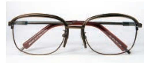
Rectangular, Full-Rim, 53/19 Lens

Please contact your local Oxy-View representative, visit our website at www.oxyview.com or call toll free 1-877-699-8439 for current styles and color availability