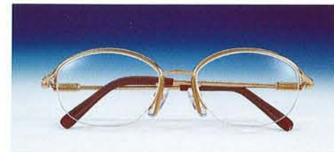
Oval, Half-Rim, 51/17

Oxy-View eyeglass frames are available in several fashionable colors. Please call toll free 1-877-699-8439 for available colors. Whichever color you choose, you'll find them an attractive and comfortable way to get the oxygen your doctor has prescribed. Always consult your doctor before changing your oxygen delivery system.