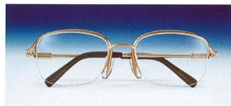
Rectangular, Half-Rim, 53/19